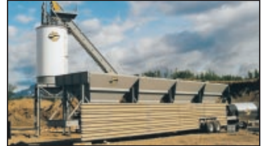
"DM Series" Drum Mix Plant—Alaska