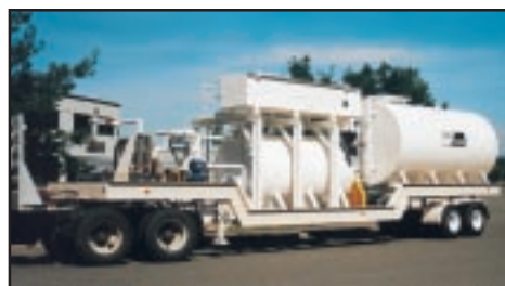
Lime Slurry System—California