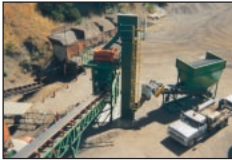
"Black Gold" Rap Crusher & Feed System—Ohio

www.aescomadsen.com sales@aescomadsen.com