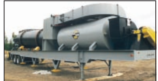
"DM Series" Drum Mix Dryer—British Columbia, Canada