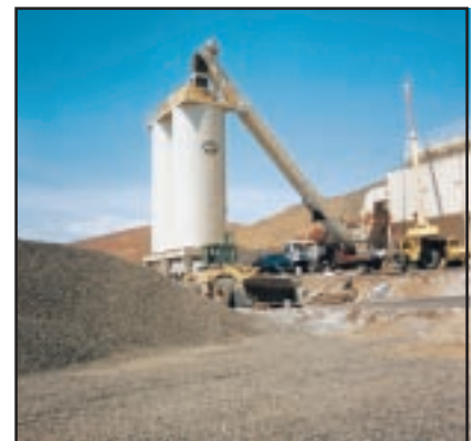
Twin 200 Ton Silos—Washington