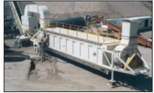
92,000 CFM Portable Baghouse & 600 Tonnes/Hr Drum Mixer—Alberta, Canada